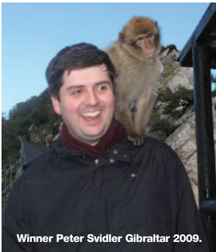
Winner Peter Svidler Gibraltar 2009.

Any eligible player meeting at least 7 FIDE rated opponents in the Open or the Challengers with a Tournament performance of 2350 or higher shall also qualify for the right to play in the British Championship 2010.